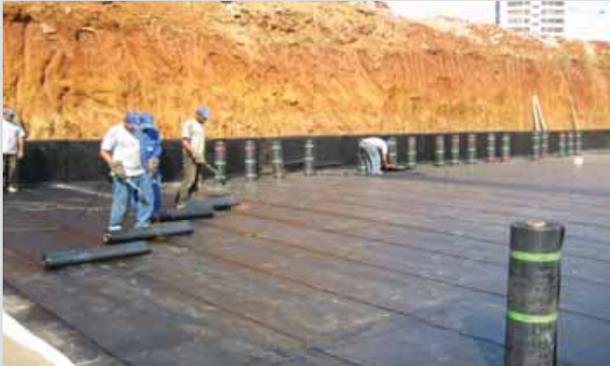
Waterproofing & insulation