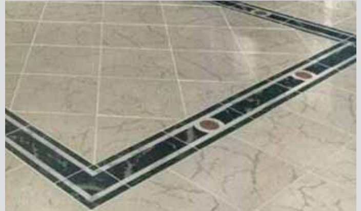
Adhesives & grouts